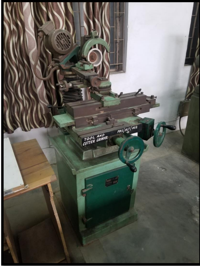
Tool & Cutter Grinder