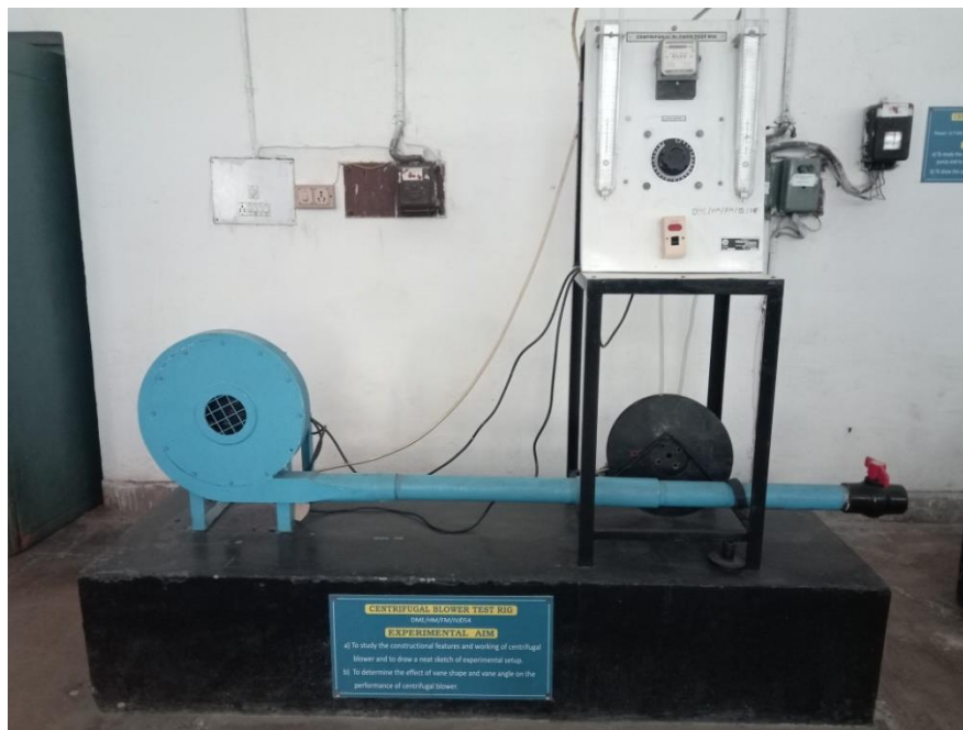
Fig.6: Centrifugal Blower Test Rig