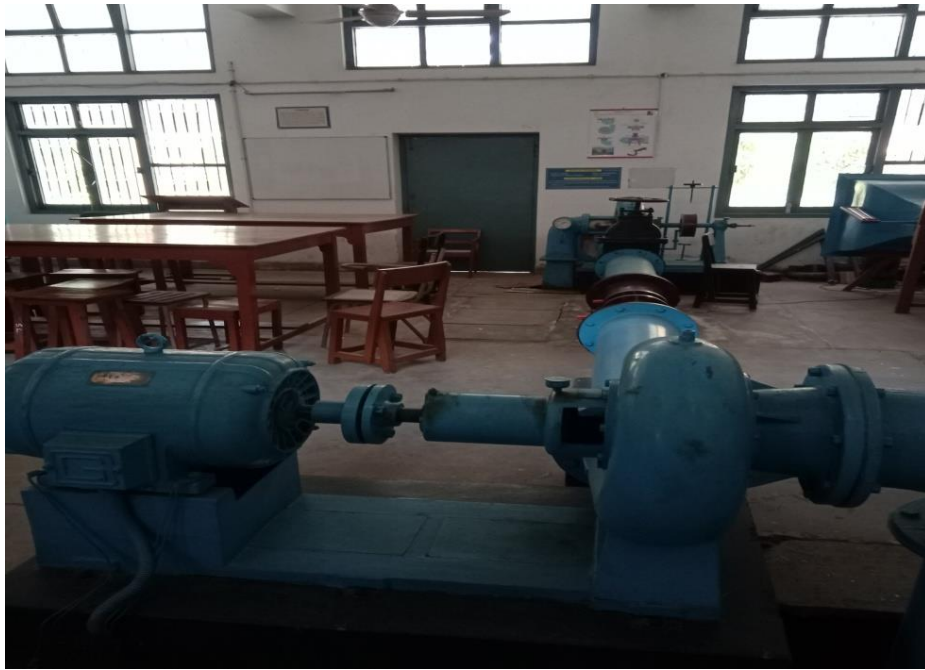
Fig.7: Kaplan Turbine