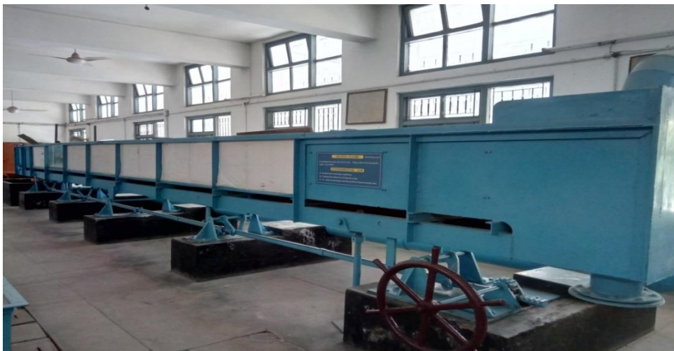
Fig.8: Adjustable Tilting Flume