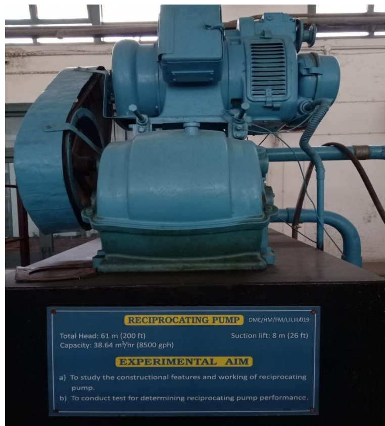
Fig.4: Reciprocating Pump Test Rig