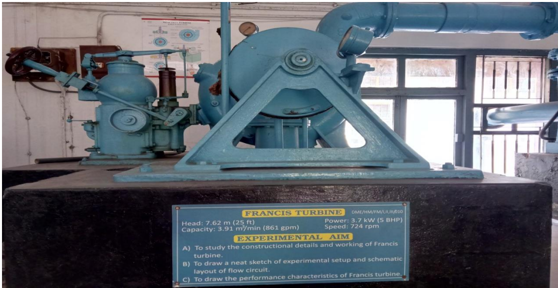
Fig.1: Francis Turbine