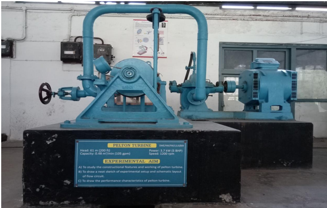
Fig.3: Pelton Turbine