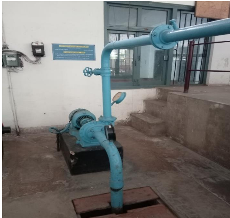
Fig.5: Centrifugal Pump Test Rig