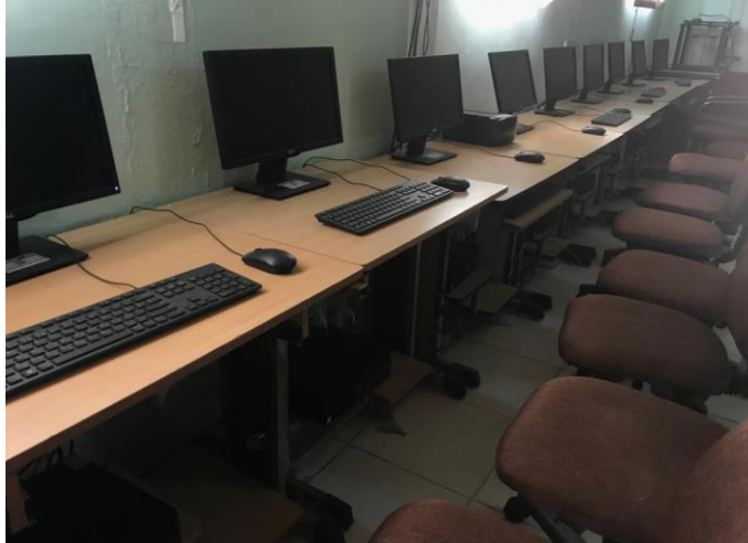
Figure 3: CAD and Simulation Lab.