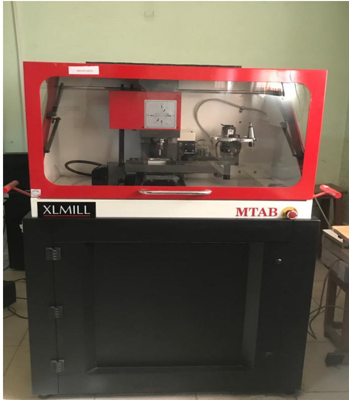
Figure 1: MTAB XL MILL